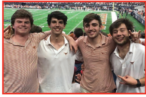
Brothers support Texas football.

The recruitment committee is excited to begin the process of meeting the upcoming fall 2019 new member class. If there are any high school seniors you would like the committee to invite